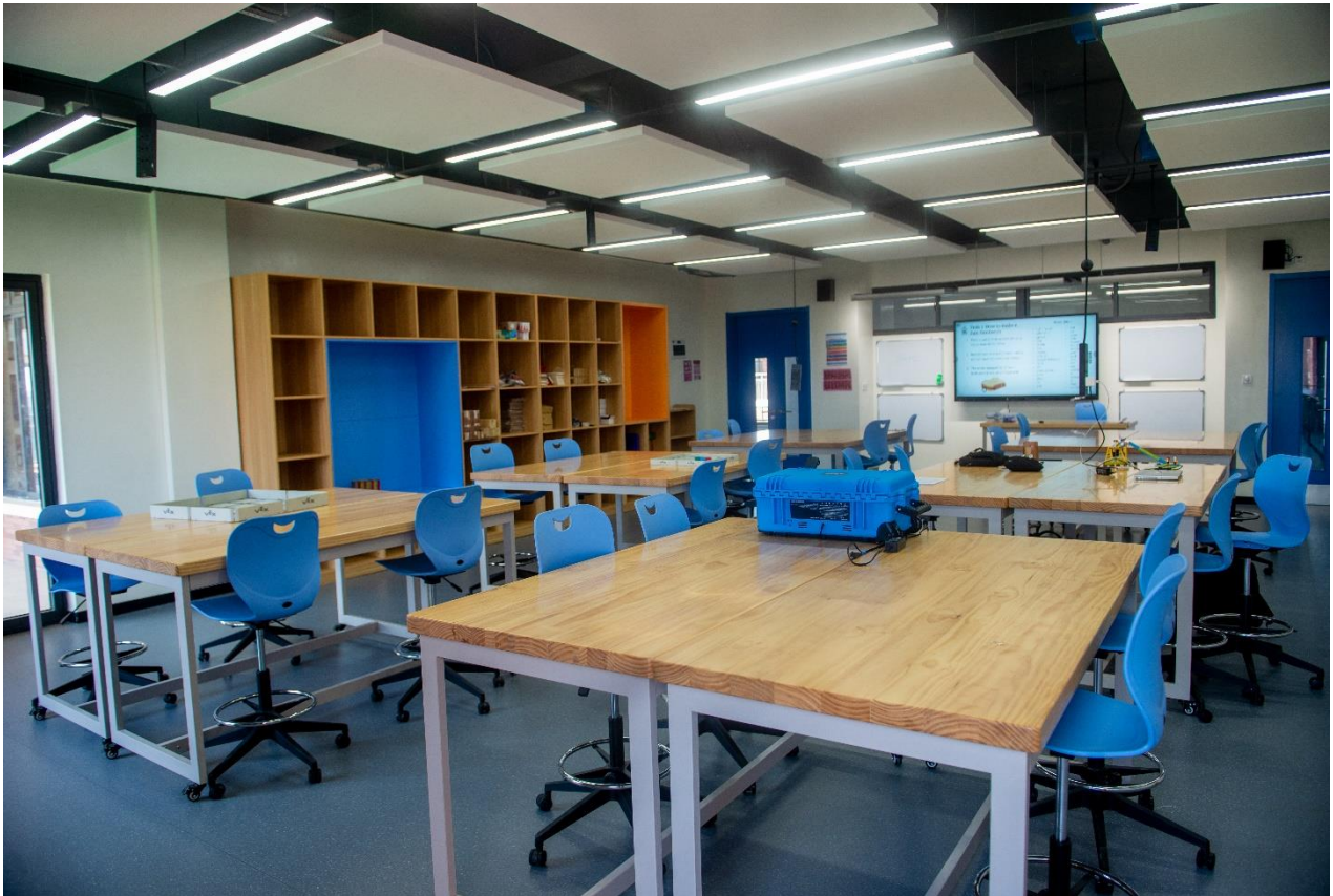
Primary School Stem Room

The school offers an international education for students aged 5 to 18 (Years 1 to 13) using the British curriculum and leading to the IGCSE and A level qualifications. These will allow our students to aspire to the very best universities worldwide.