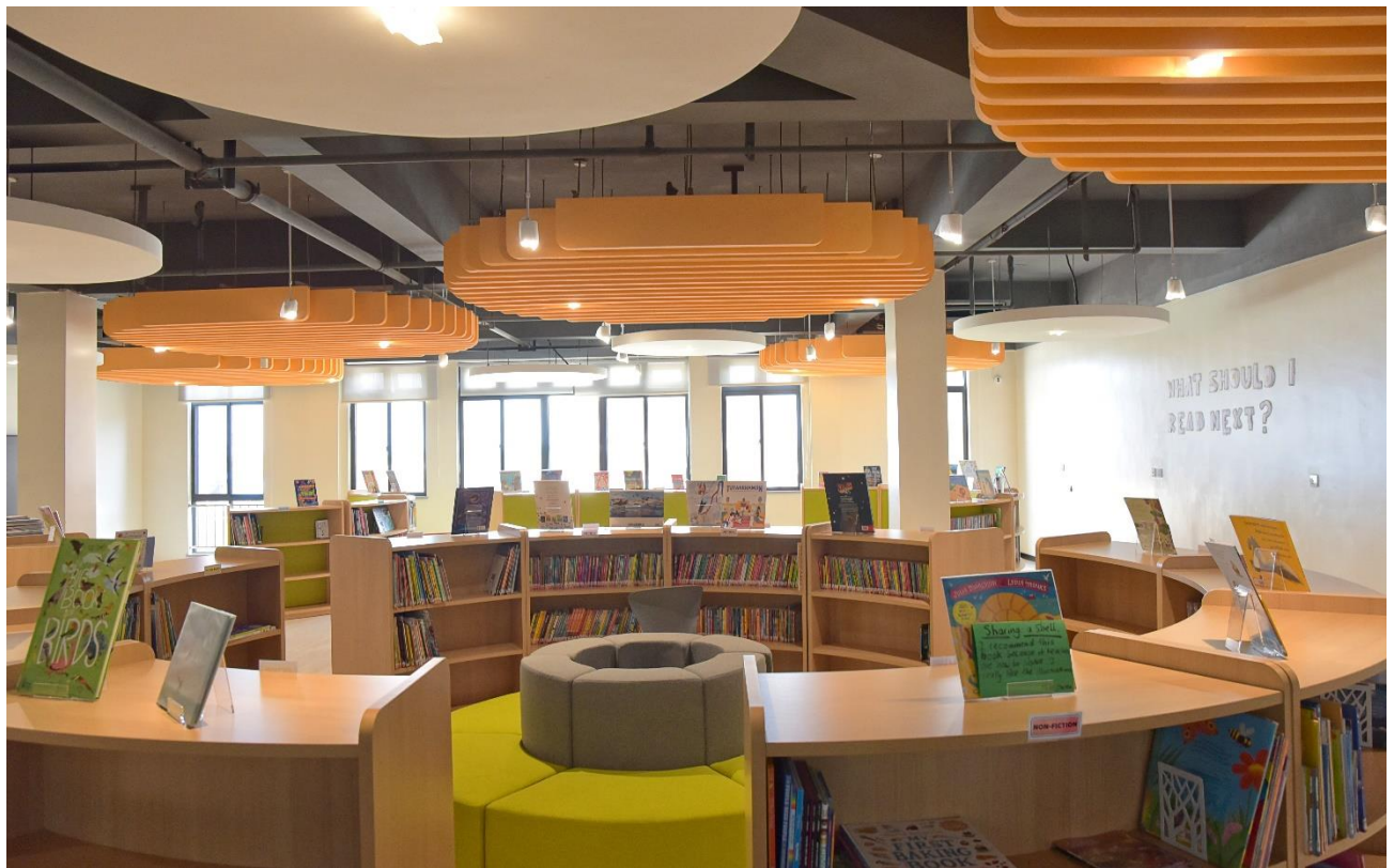
Primary School Library