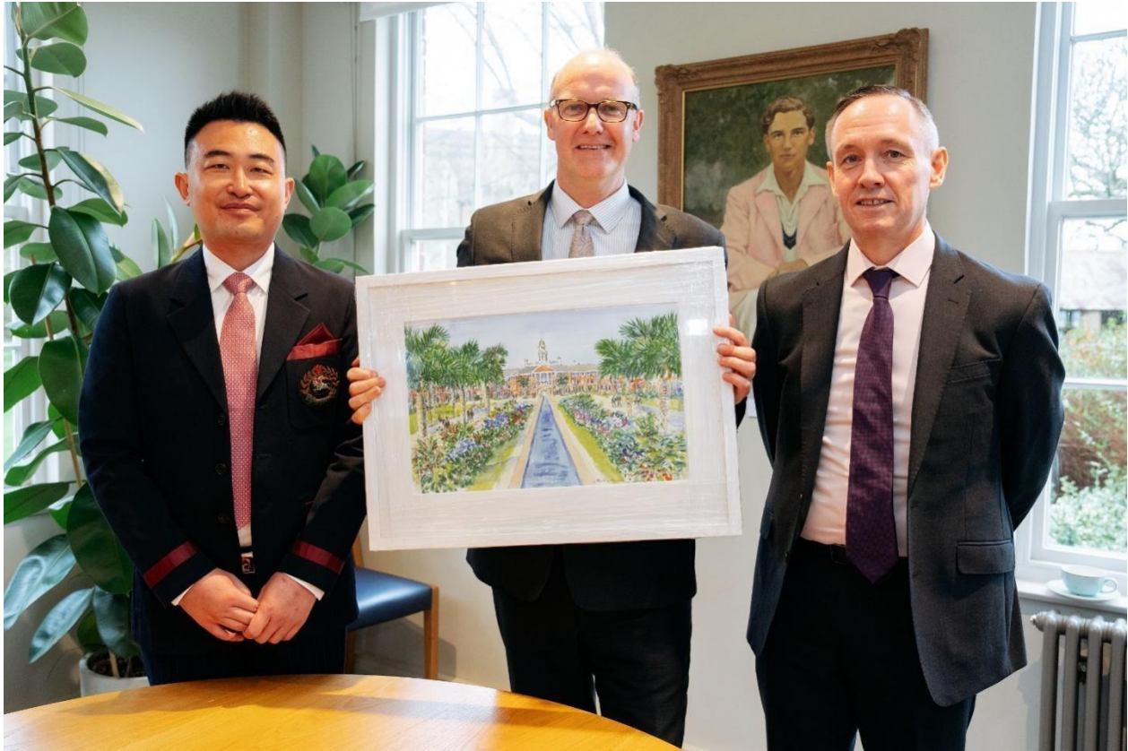
Official signing of the Charterhouse Lagos Agreement at Charterhouse UK